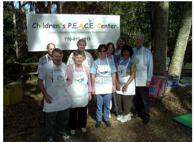
In Kind Donations 2003 Estimated Market Value $120,310.00

SUCCESES: For the year 2003, just under 1500 children, plus 150 families, along with 866 other adults enjoyed the traveling museum and some of the outreach programs. We made four local and five long distance visits covering almost 3000 miles. Two Board Members attended a conference for Emerging Museums in Houston, TX with the Association of Children's Museums. Board Members spent many hours in training classes, and doing paperwork. We were finally incorporated, obtained our Tax Exemption, built our Board to four members and began the four year Business Plan. We also ended the year with a new website, and lots of friends and supporters.